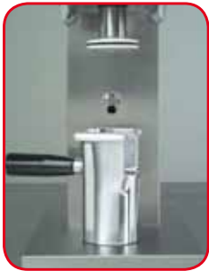
Anticorrosional aluminium moulds. Spaghetti mould included