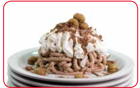
An example realized with "Spaghetti" mould