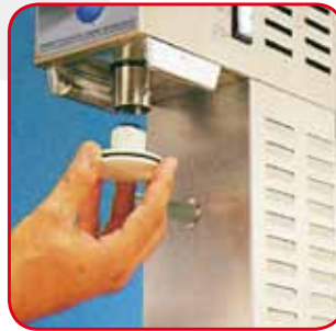
Easily removable Makrolon® piston for a perfect cleaning